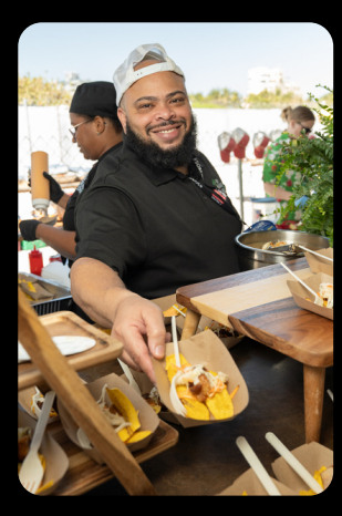
PRIVATE EVENTS & CATERING