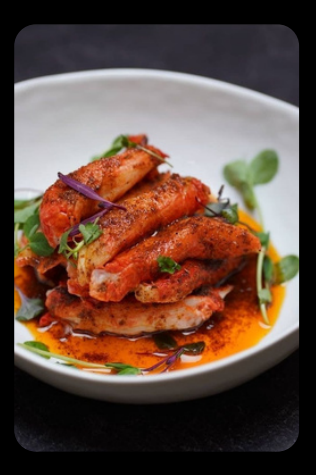
MENU DEVELOPMENT & CONSULTING