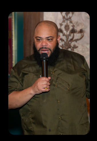
SOCIAL MEDIA & BRAND PARTNERSHIP