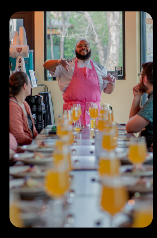
KEYNOTE SPEAKER & LIVE DEMOS